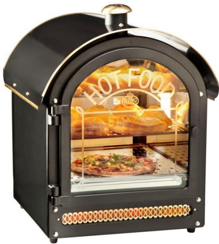
Hot Food Merchandiser Black

The ideal way to serve and display hot potatoes and many other foods, the King Edward Merchandiser is manufactured to the CE standard, and is made to the same high standards as all our other products. You may already have adequate oven capacity but do you have an attractive point of sale unit to display you're ready to serve food?