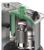
Scraper spatula for cleaning the tank and lid during processing